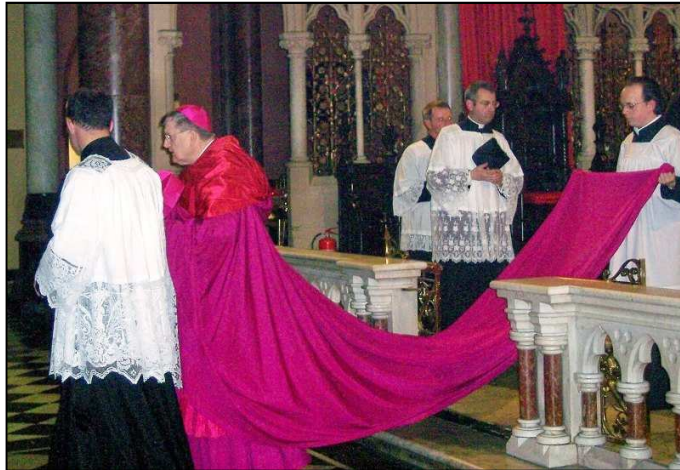
(Archbishop Raymond Burke in cappa magna after the Pontifical Vespers at the Fota Conference on Saturday 10 th July 2010)