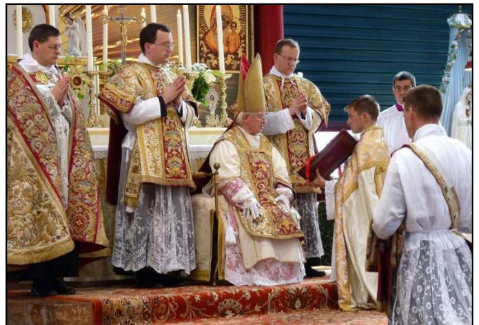
(Cardinal Cañizares in Wigratzbad)